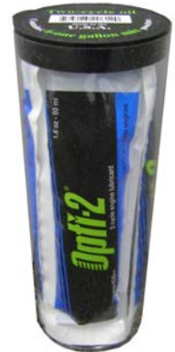
Pro-Tube protective 6-pack